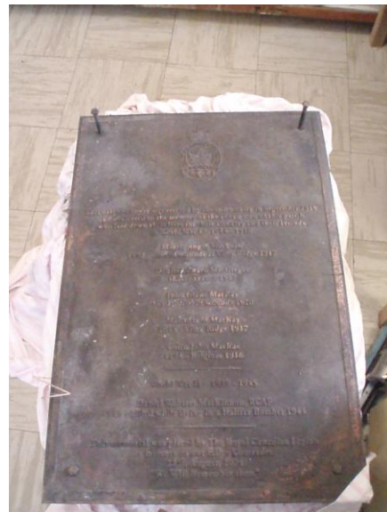
Bell Tower Plaque following fire